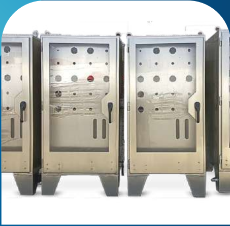
Wellhead Control Panels