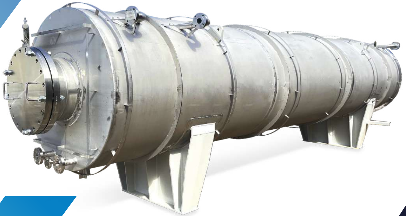
Chemical Storage Tank