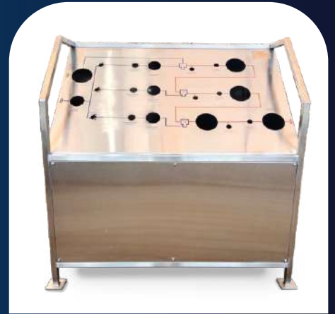
Pressure Test Unit